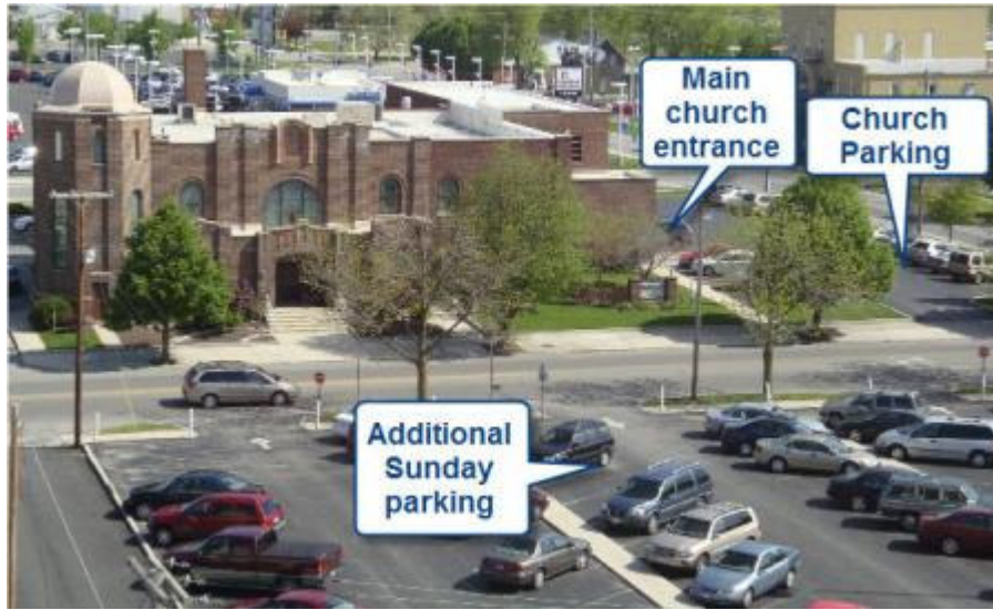
Findlay St. Paul's Neighborhood View